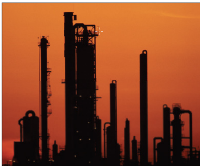
The chemicals industry uses a wide range of organic solvents for its separation processes

The miscibility of polymer and solvent systems is very important in many polymer processing operations such as for the preparation of adhesives, pharmaceuticals, cosmetics, and speciality surface coatings for metals, glasses, and plastics. Generally this type of formulation work will require considerable experimentation to develop the most cost effective formulations with highest possible polymer to solvent ratios. Formulation scientists will also be interested in developing stable base formulations then for example testing the effects of coalescing agents, pigmentation and dispersants, plus physical changes such as freeze-thaw cycles.