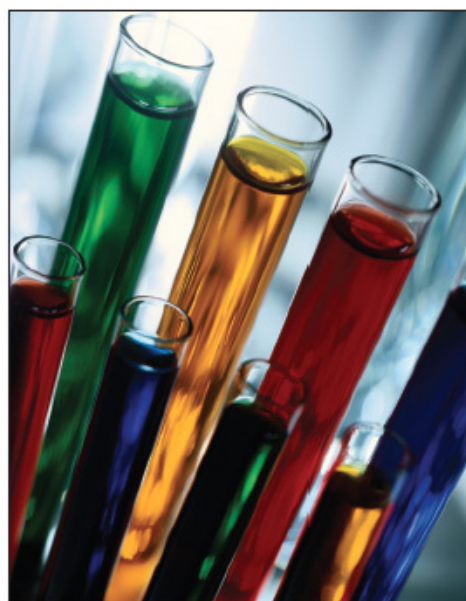
Laboratory formulation studies often require extensive solubility and compatibility studies

To learn more about BIOVIA Materials Studio, go to accelrys.com/materials-studio